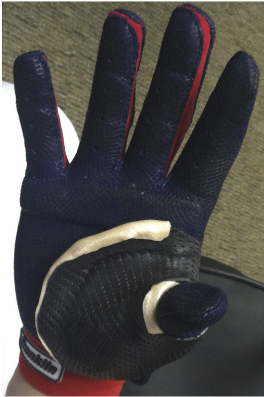
FIGURE 2: Custom orthosis designed to pad the first webspace (white flexible material) and prevent forced abduction of the thumb (black rigid material).